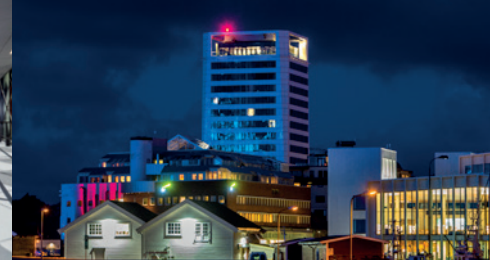
Scandic Havet, Bode, Norway