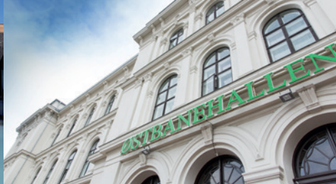
Østbanehallen, Oslo, Norway