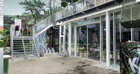
Grenthorvet, Høje Taastrup, Denmark