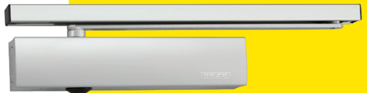
GEZE TS 5000

In Ulstein Arena, which cost almost NOK 300 million to build, very special solutions have been implemented in both the façade and the interior. Suppliers customised their products to satisfy the architect's requirements. Public buildings must ensure equal access for all, regardless of individual needs or physical limitations. GEZE's products are a shining example of what it can look like when this objective is met.