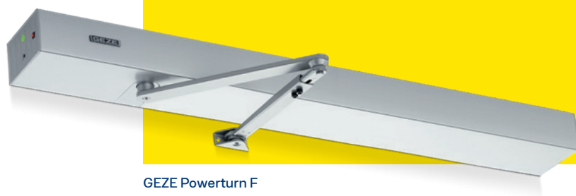
GEZE Powerturn F