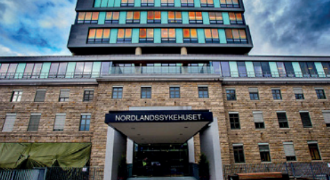
The Nordland Hospital, Bode, Norway