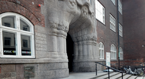
KVUC, Copenhagen, Denmark