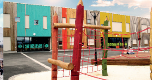
Søreide skole, Bergen, Norway