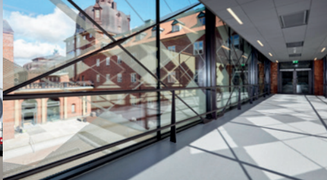
Carlanderska private hospital, Gothenburg, Sweden