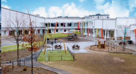
Herrestaskolan, Stockholm, Sweden