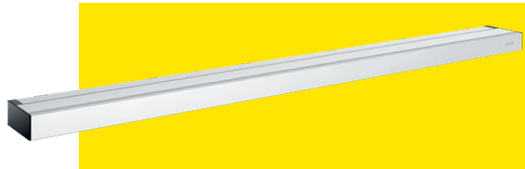
GEZE Slimdrive SL