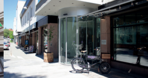
PM & Vänner, Växjö, Sweden