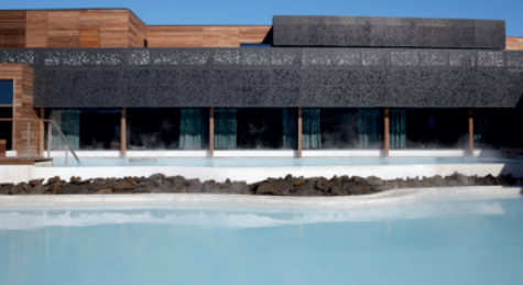
Blue Lagoon, Grindavík, Iceland