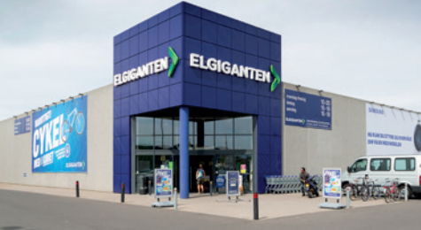
Elgiganten, Odense, Denmark