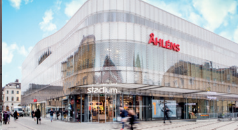
Åhlénshuset, Uppsala, Sweden