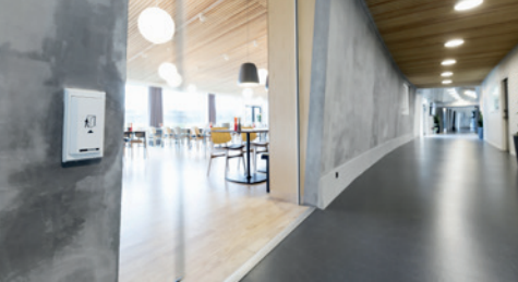
Musholm, Korsør, Denmark